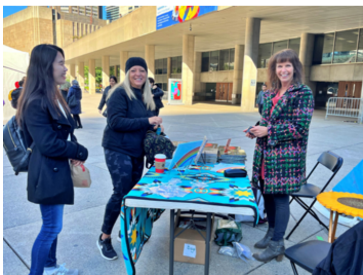
Fundraising for Our Children's Medicine.