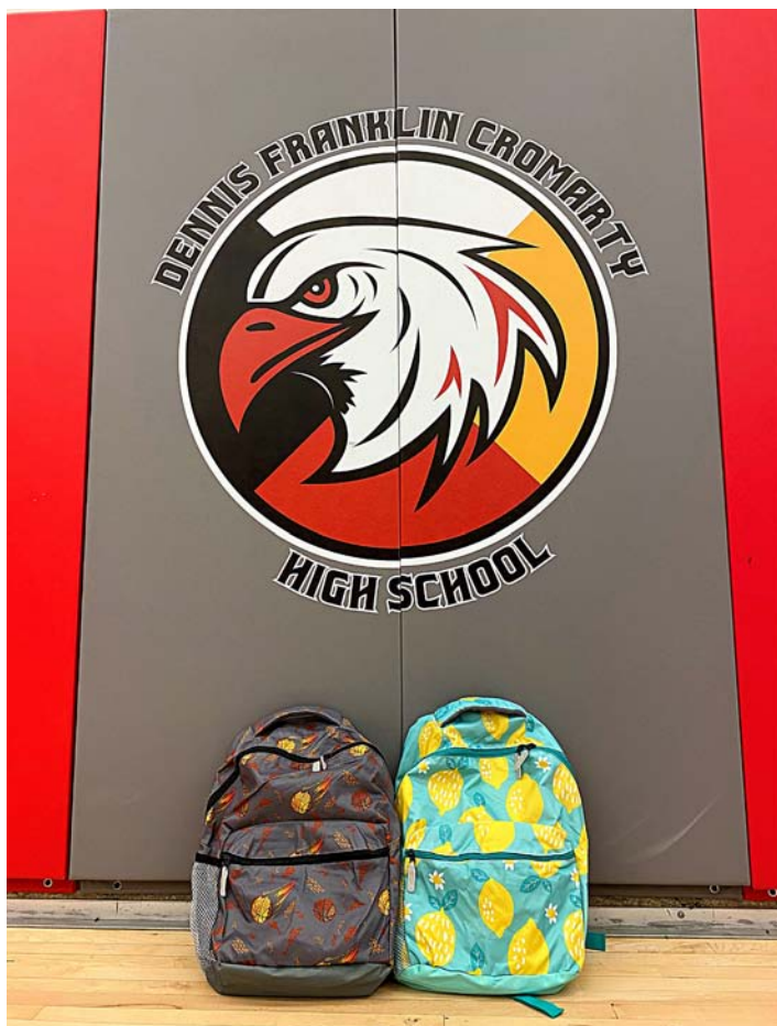
Backpacks donated by Costco arrive at DFC.