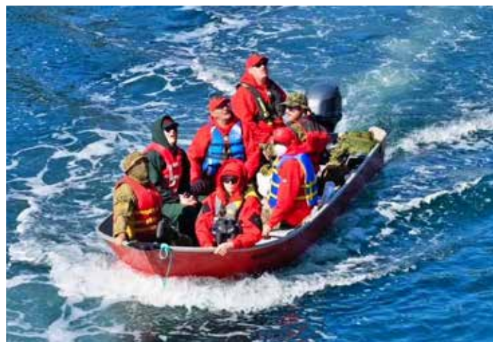
Using small boats in the Salish Sea.