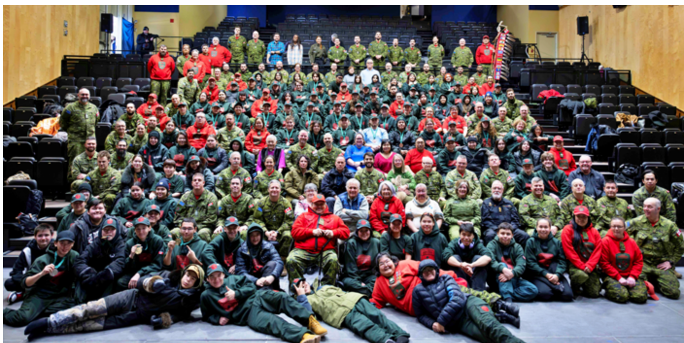
Group picture of the participants of the Winter National Training Session for Junior Rangers accompanied by the Governor General, Her Excellency Mary May Simon at Kuujjuaq on Jan 13th 2024.