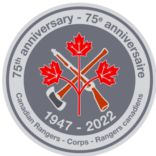
Fig. 1 CR75 coin obverse