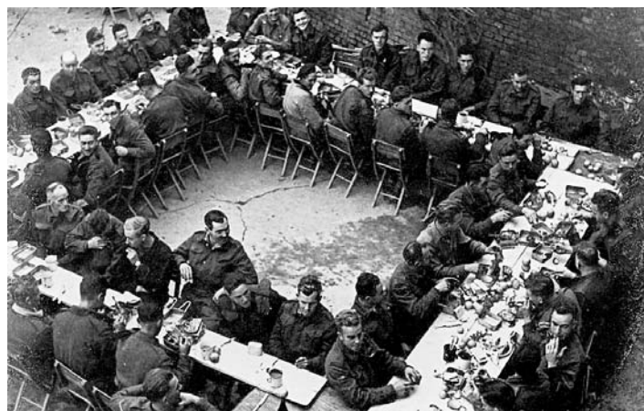
Christmas lunch during the Battle of Ortona