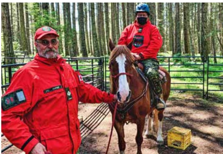
Horses in support of Canadian Rangers.