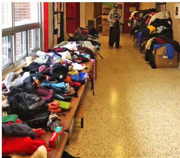
DFC Winter Coats Distribution