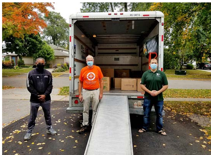
Loading cargo bound for DFC from Rotary, Robin Hood Army Canada, and Hip, for shipping by Trucks for Change via Gardewine.

The cost of purchasing supplies going to First Nations fly-in communities located in Northern Ontario is double or triple that of Southern Ontario communities. Therefore obtaining basic equipment and necessities for school has become a barrier to students' education.