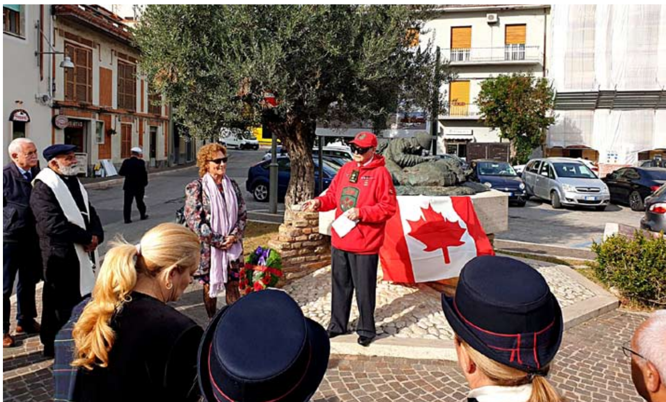
Plaques sponsored by AGF and the Ranger Foundation