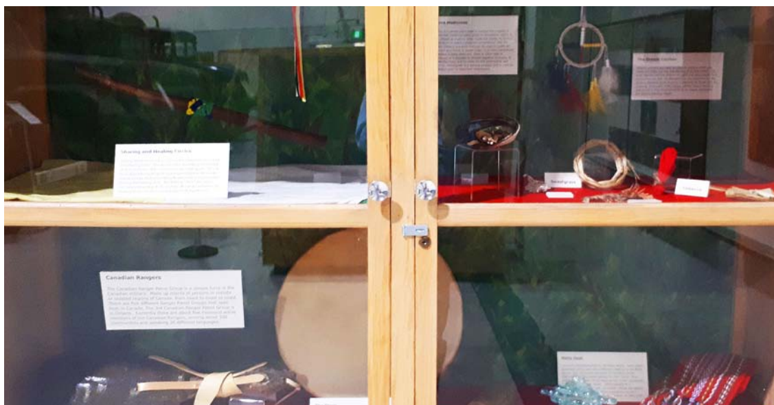
The 3rd Canadian Ranger Patrol Group display part B