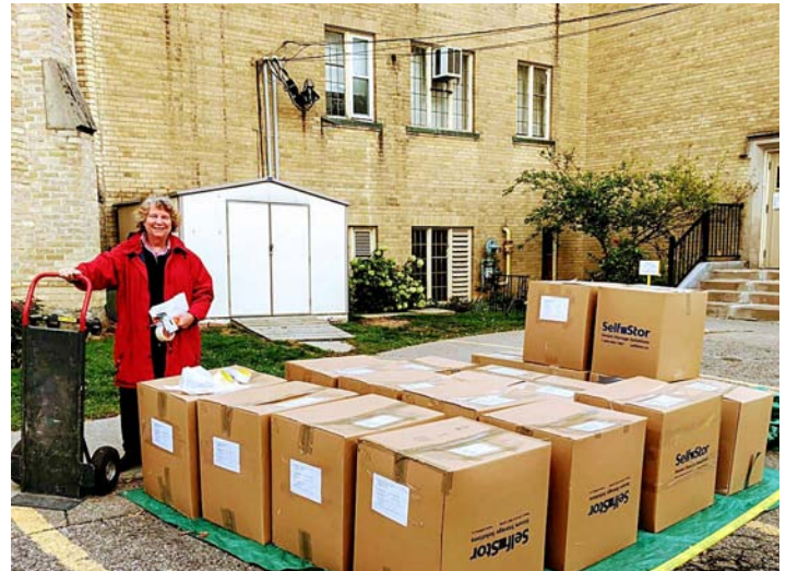
Parkas and school supplies for DFC students, from RHUC supporters.

new bathing suits for use in the sweat lodge program as well as for swimming lessons at the community centre. Polaris Transport generously picked up the cartons (donated by SelfStor), from RHUC and delivered them to the designated shipping depot for Gardewine's trip north.