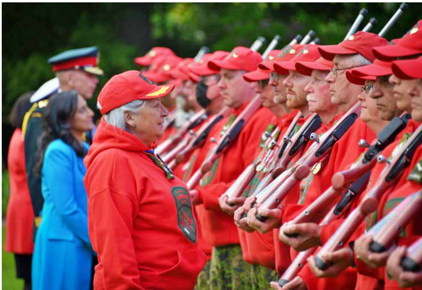
Her Excellency the Governor General inspects the 100 CR Guard of Honour. Minister of Defence, Anita Anand, and Chief of the Defence Staff, General Wayne Eyré in the background.