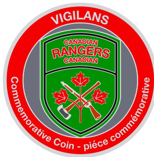
Fig. 2 CR75 coin reverse

When planning started in earnest for CR75, the Honorary Lieutenant Colonels (HLCols), there is one appointed to each Canadian Ranger Patrol Group (CRPG), consulted to think about how they could contribute to this significant historic milestone. We knew that the CAF would fund what it could to make the anniversary a success, but a commemorative coin is normally not purchased from public funds.