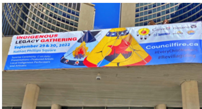
Event banner hung at City Hall square.