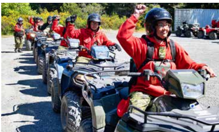
Canadian Rangers practice safe use of ATVs.