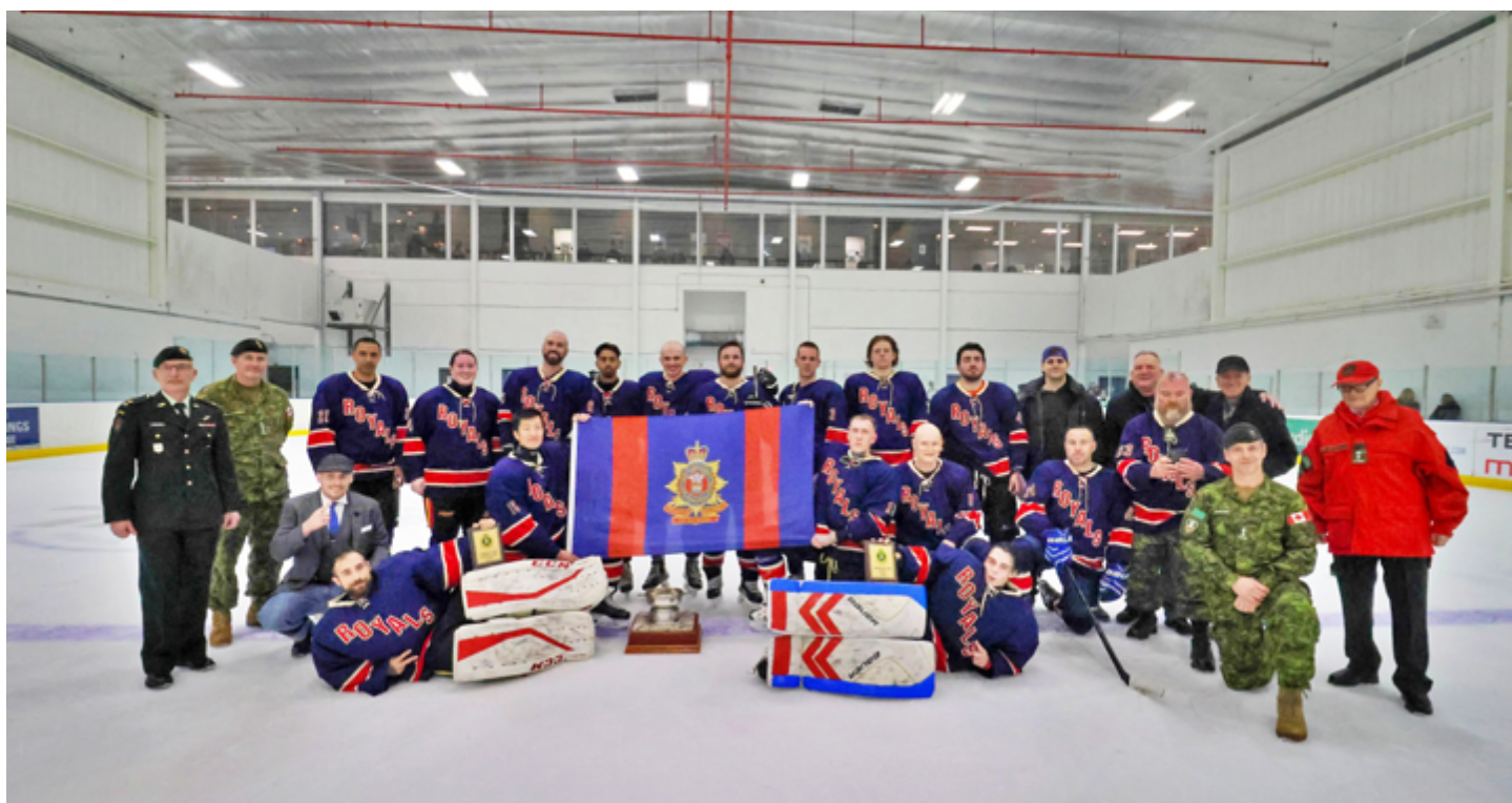
Winners of the 8th Annual Ranger Cup, The Royal Regiment of Canada.