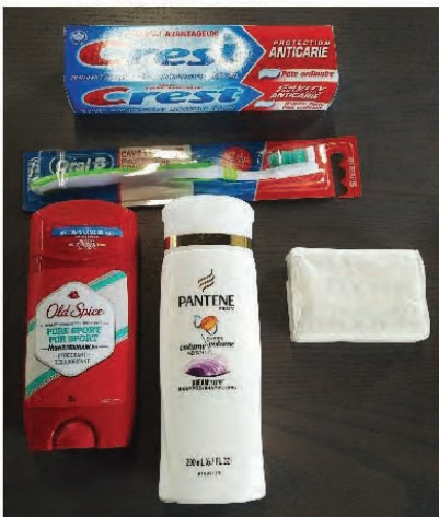
DFC Male Hygiene Kit

I want for all our students. There is an ongoing need for these life essentials, so this generous donation by Procter and Gamble will go a long way in providing our students with a happier and more normalized Canadian high school experience.”