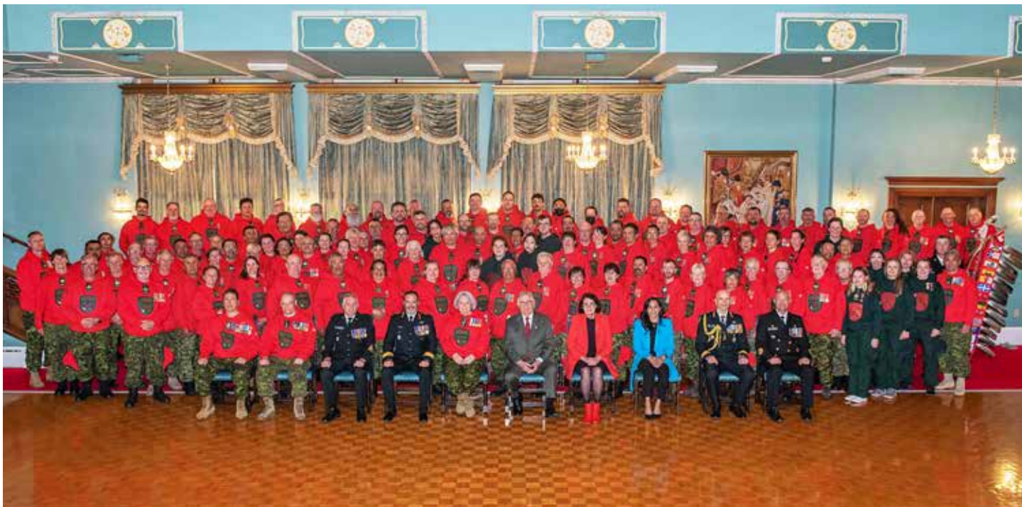
Her Excellency the Governor General with the 100 Canadian Ranger Guard of Honour, Lieutenant Governor of British Columbia, Janet Austin and other dignitaries.