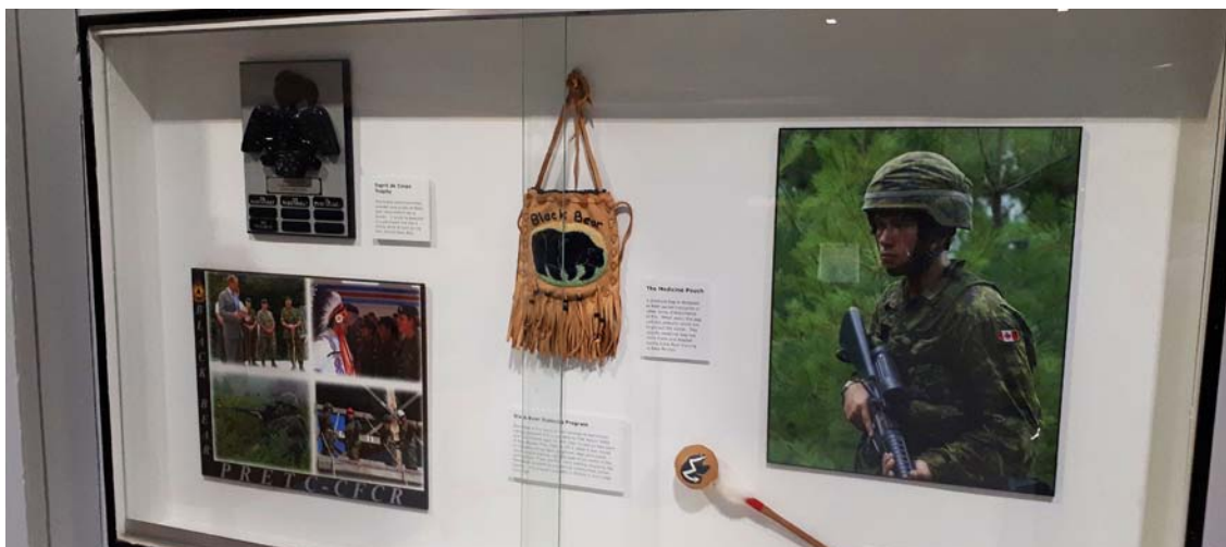
The Black Bear Training display