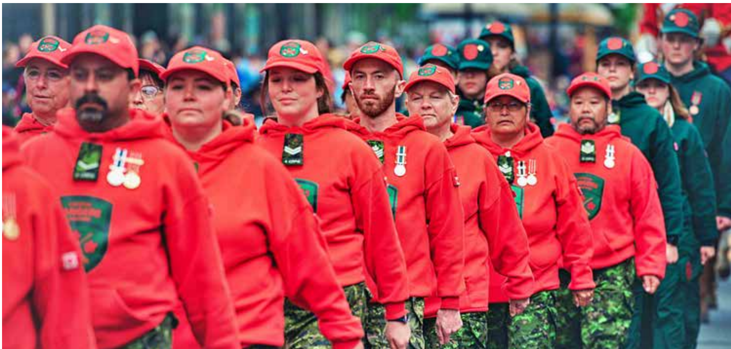
Canadian Rangers march in Victoria.