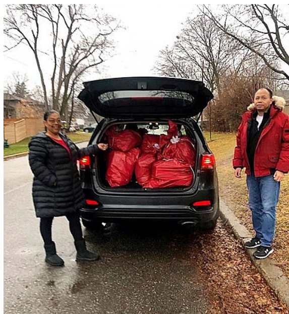
Gifts and essential items were delivered to vulnerable families.

When the December holiday season came upon us, we decided to continue supporting the community by being surrogate Santas and sponsored several large families, including one with six children. We wanted to ensure they had all the fixings for a wonderful holiday! To that end, winter clothing, groceries and toys were provided as well as electronic devices to assist children with their virtual school learning. All recipients were supplied with necessary hygiene kits. Moms received winter clothing, kitchenware and pyjamas. Gift cards were also purchased for the families from various stores including Loblaws, Roots, Foot Locker and Walmart.