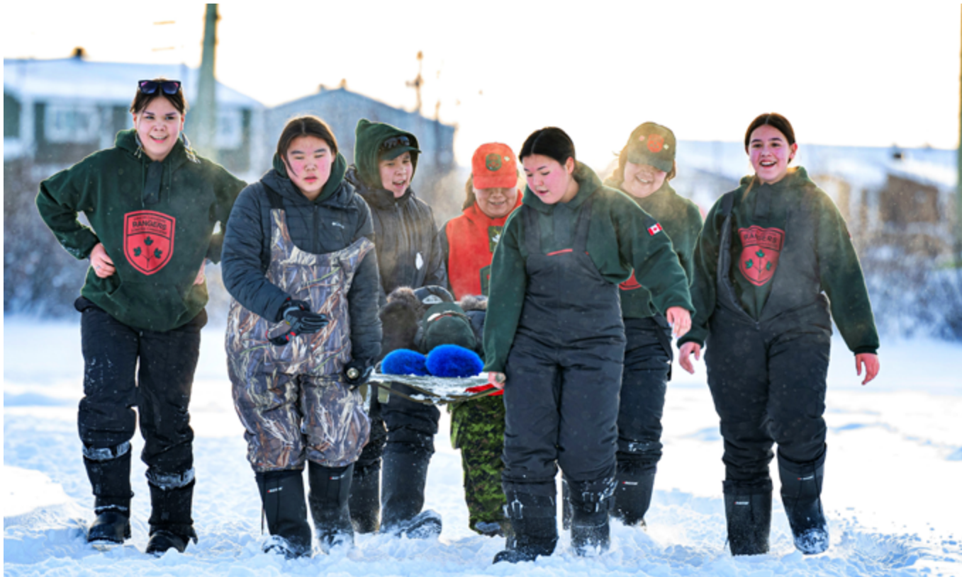
Junior Canadian Rangers participated on outdoor competitive activities during the 25th anniversary of the Canadian Junior Rangers in Kuujuaq on Jan 12th 2024.