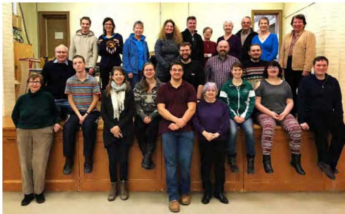
RHUC Work Party 1