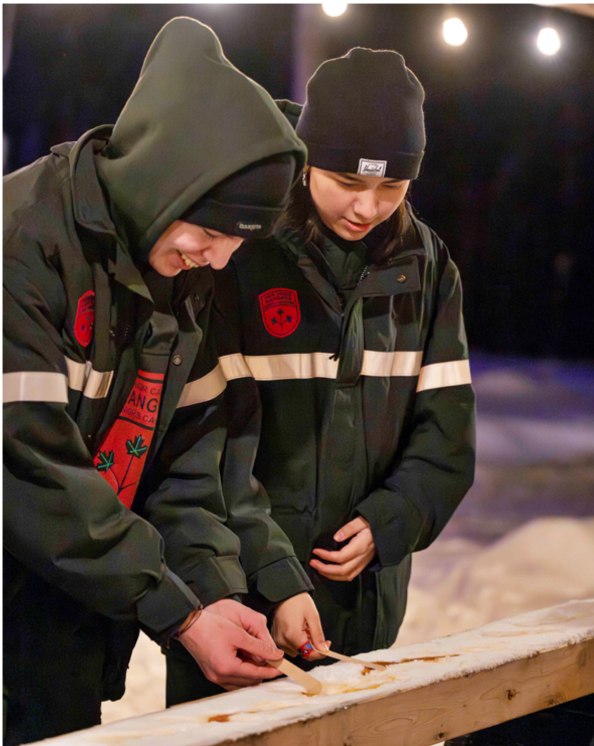
The Canadian Junior Rangers visited a sugar shack during the celebrations of the 25th anniversary of the Canadian Junior Rangers on Jan 14th 2024.

The Winter National Training Session for Junior Rangers commemorating the 25th anniversary of the Canadian Junior Ranger program was a great success and the participants loved the experience. The Junior Rangers made bonds and memories that will last for a lifetime.