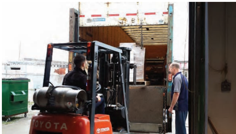
Kits are shipped to Dennis Franklin Cromarty