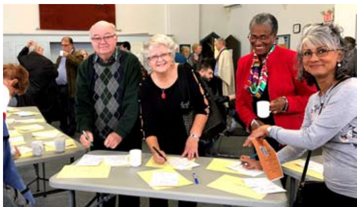
Signing cards of friendship for DFC friends.