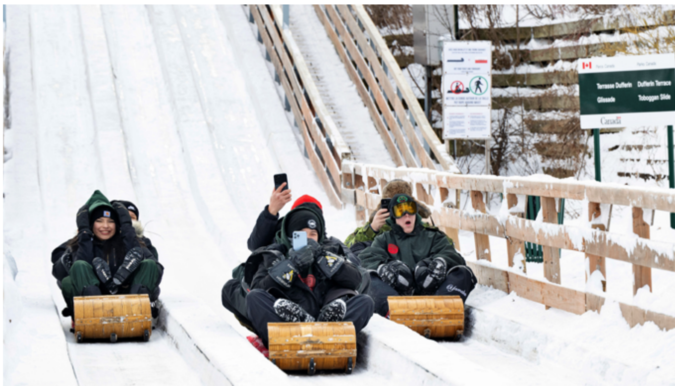
The Canadian Junior Rangers participated on outdoor activities in the city of Quebec on Jan 14th 2024.