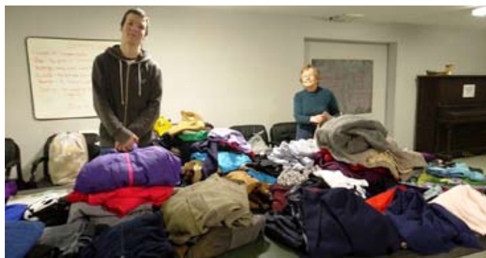
RHUC winter clothing drive for DFC students.