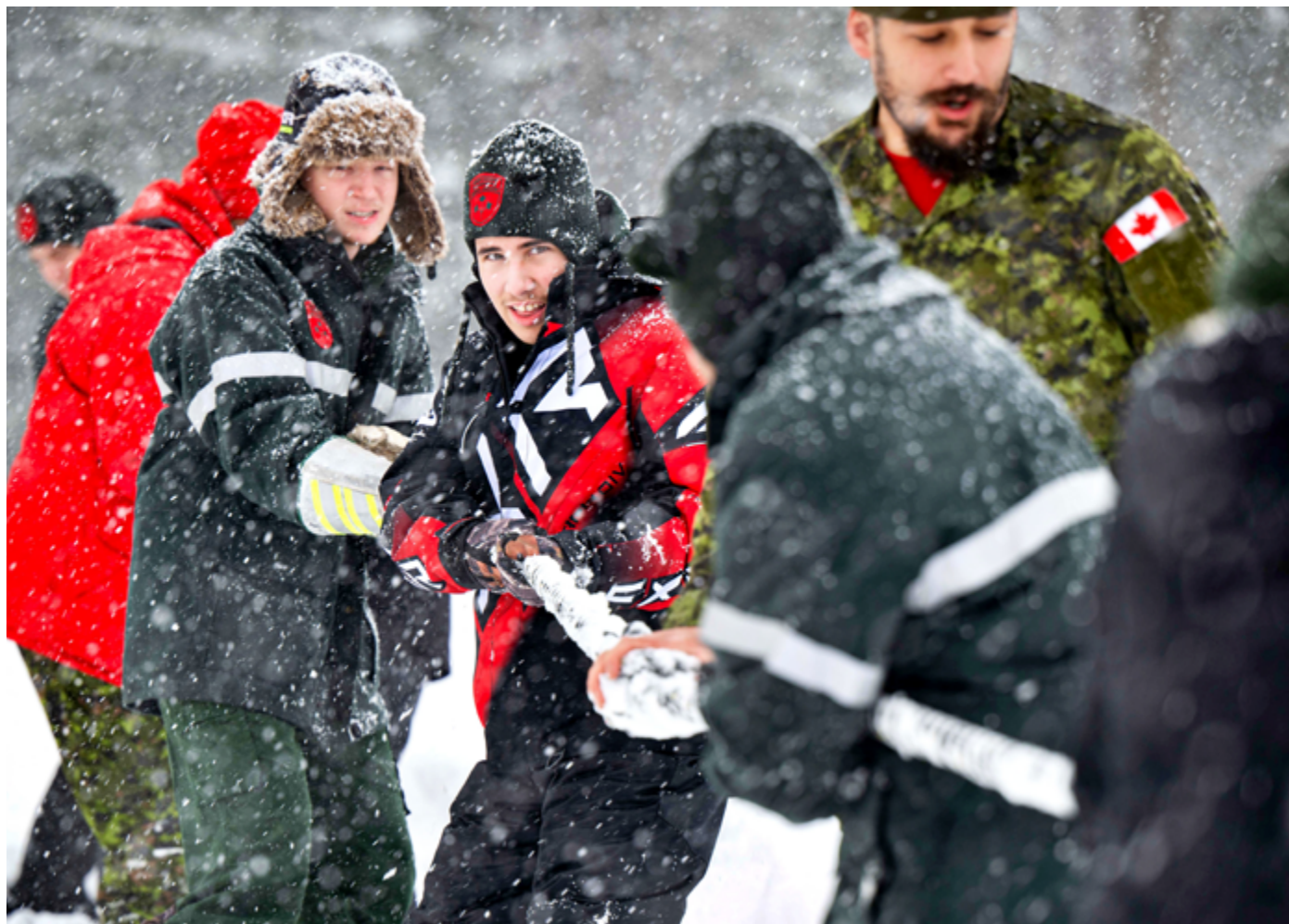
Junior Canadian Rangers from the 3rd and 5th Canadian Ranger Patrol Groups participated at a Tug of war game à CFB Valcartier on Jan 10th 2024.

The following day, the JCRs took part in various outdoor activities in two different plateaus. The first plateau was a Commander's Challenge, where the Junior Rangers competed in various activities where they were timed and scored and received rewards in accordance with their performance. The second plateau was more of a learning experience where the Junior Rangers were taught how to build shelters in the tundra and they also had the opportunity to fish through the ice. The Governor General, Her Excellency Mary Simon, who grew up in Kuujuaq, honoured the event with her presence and took the time to visit the Junior Rangers and talk to the locals.