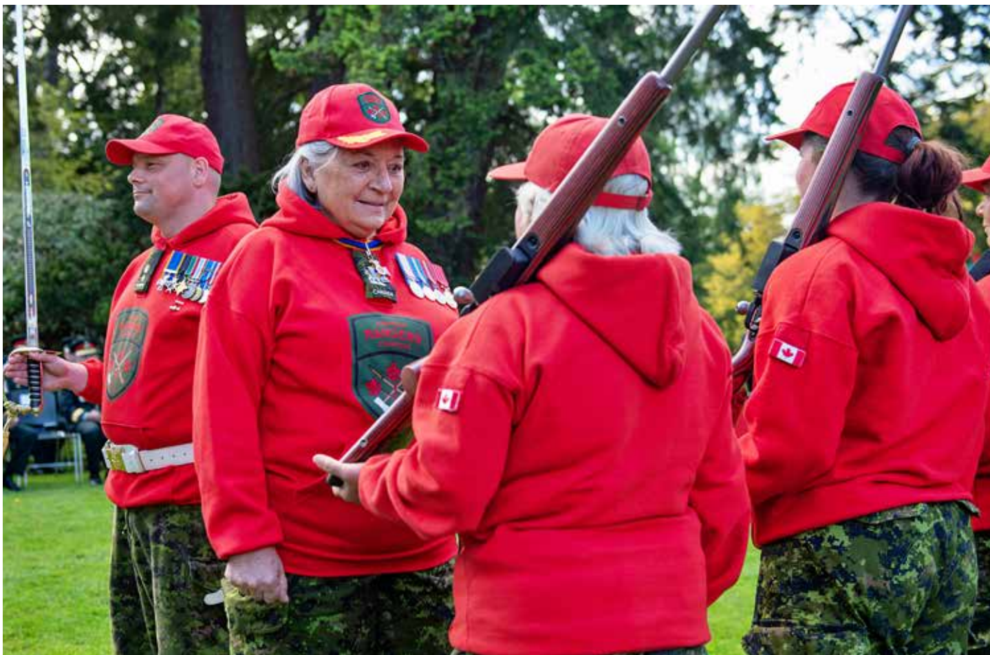
Her Excellency Governor General Mary May Simon speaks with a member of the CR Guard of Honour.