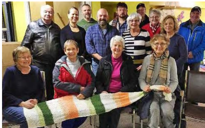
RHUC Work Party 2

Richmond Hill United Church (RHUC) and friends adopted the December DFC Friendship Winter Coat Project of providing the needed items, sharing the news of the coat drive with and beyond the congregation, with families and neighbours, workplaces and schools, hiking clubs, and Scout Troop families. RHUC and other generous donors from as far away as Florida sent cash donations and provided 850 much-needed items, including 184 new/gently used warm winter coats, 100+ hats and mitts, plus scarves, snow pants, boots, backpacks, running shoes, sweaters and other clothing, and sports gear including uniforms for soccer and hockey teams. During two work parties 36 RHUC volunteers sorted, checked, logged, and packed dozens of cartons on 3 pallets. With generous support from Trucks for Change, Erb Transport, Snowbird Transport, and HIP, the skids were shipped, cost-free, directly to the school, so the students received warm coats and gear early in January in the bitterly cold winter semester.