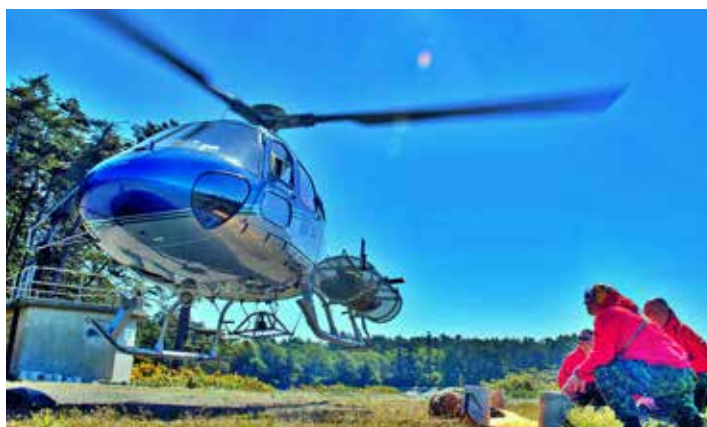
Helicopter rescue landing.