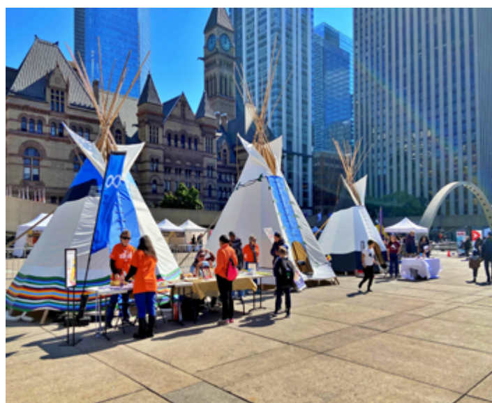
Teepees in the square.