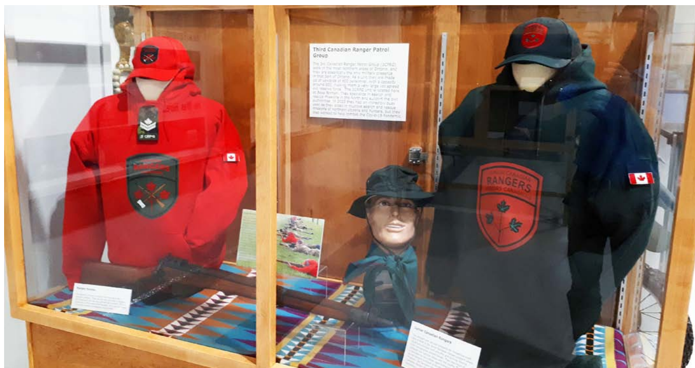
The 3rd Canadian Ranger Patrol Group display part A