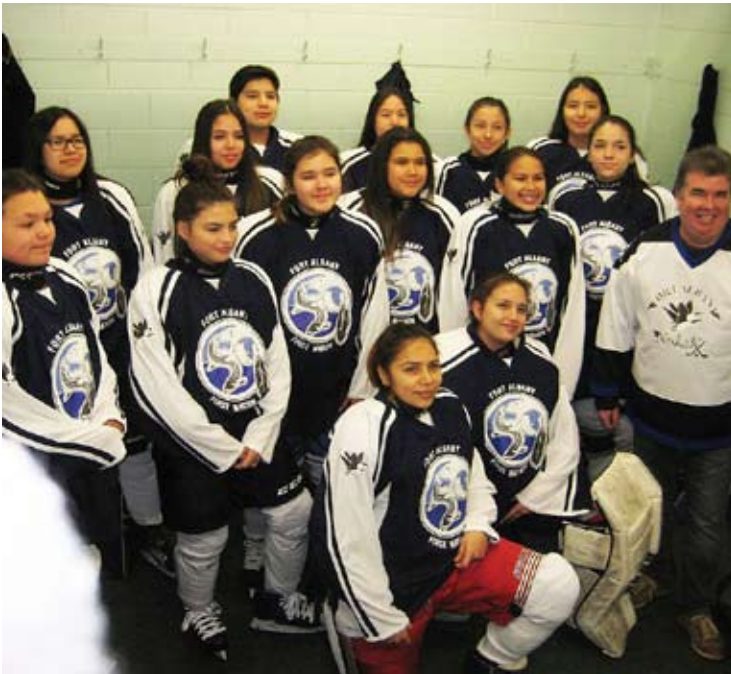
The Fort Albany NISKAK First Nations Hockey Team sponsored by HIP

Building on an initiative started by the Rotary Clubs of Etobicoke and Palgrave, Rotarians across the Greater Toronto Area have come together to collectively sort, pack and deliver 61 pallets of hockey equipment to more than 2000 Indigenous girls and boys located in isolated communities in Northern Ontario and Manitoba.