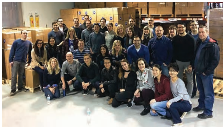
DFC Hygiene Kits were packed by P&G staff