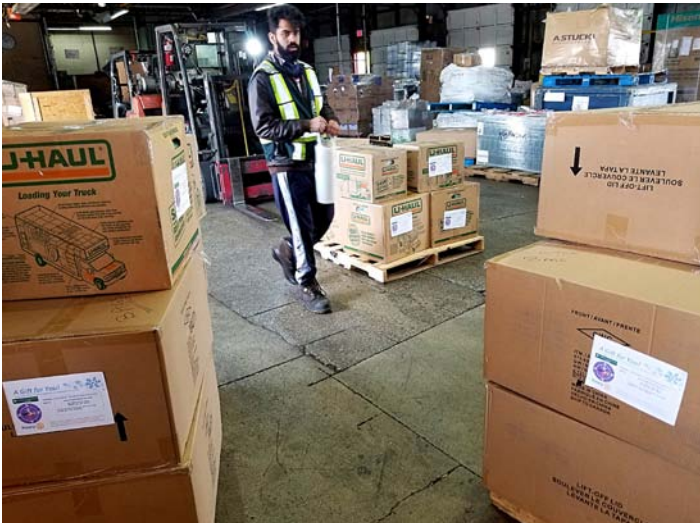
Supplies donated by Rotary, Robin Hood Army Canada, and HIP await shipment by Trucks for Change via Gardewine.