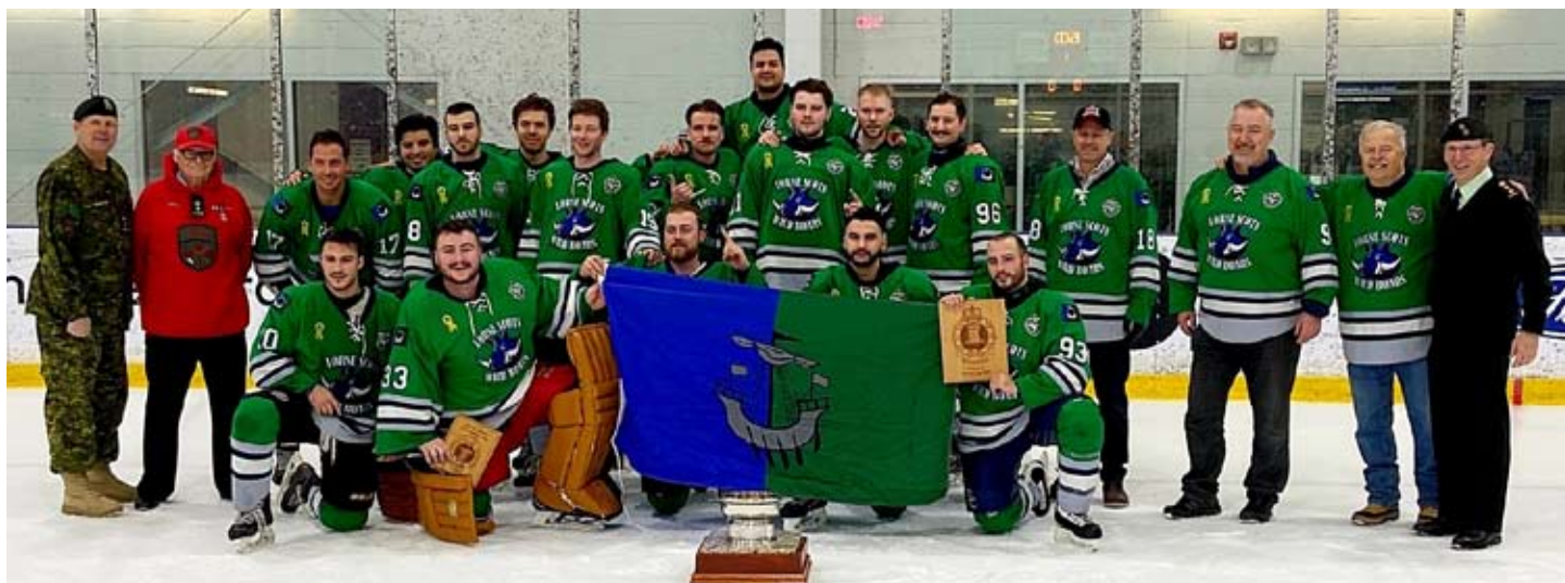
The Lorne Scots - 2019 champions