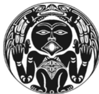
Above: Musqueam and Snuneymuxw First Nations